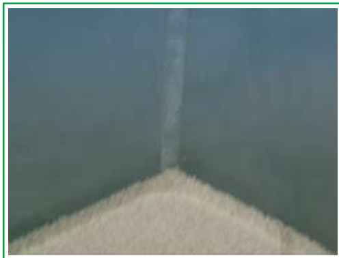
Brigade® Granules showing superior flow and reach of the granules with no bridging in the crevice passage

Superior “rollability” of the unique rounded granules in Brigade® Granular Insecticide ensures the product flows to the full extremities of the cracks and crevices to give the most effective control possible.